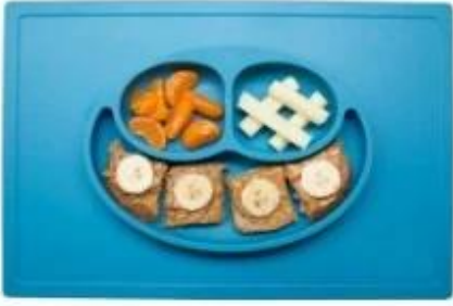
square smily silicone placemat