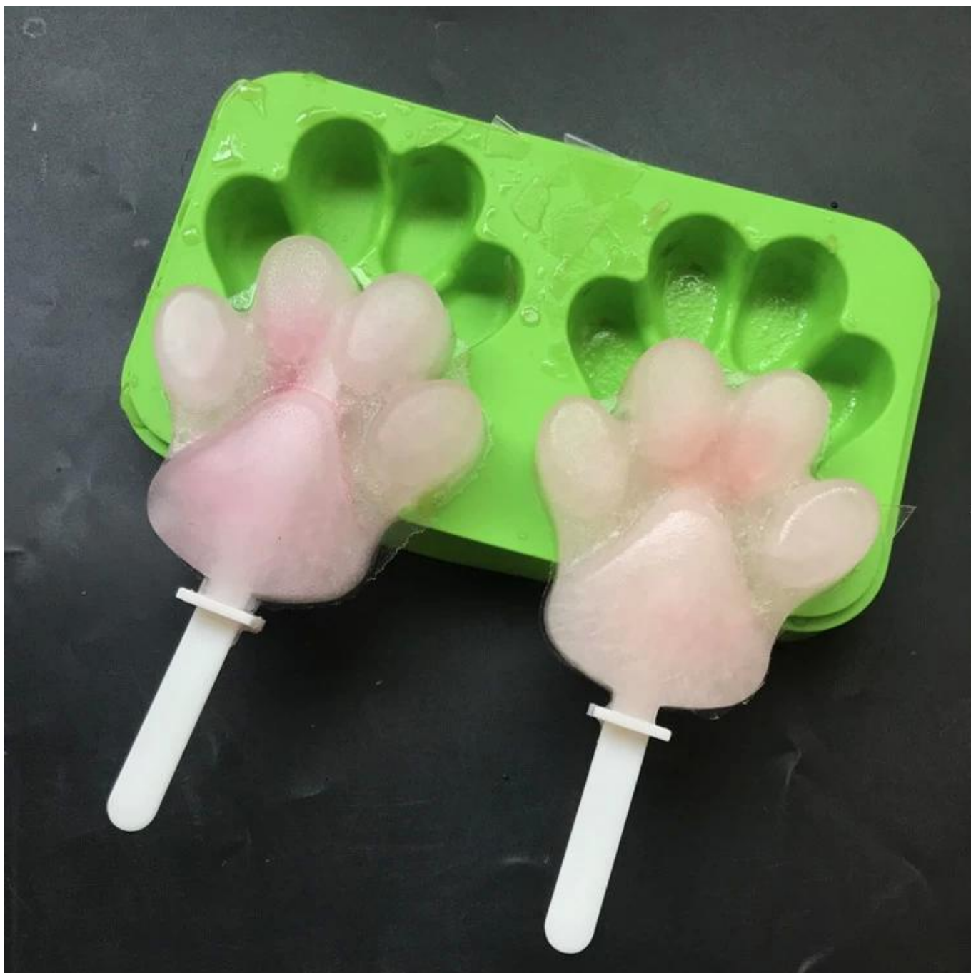
Bandeja do cubo de gelo do silicone por atacado / molde da bola de gelo