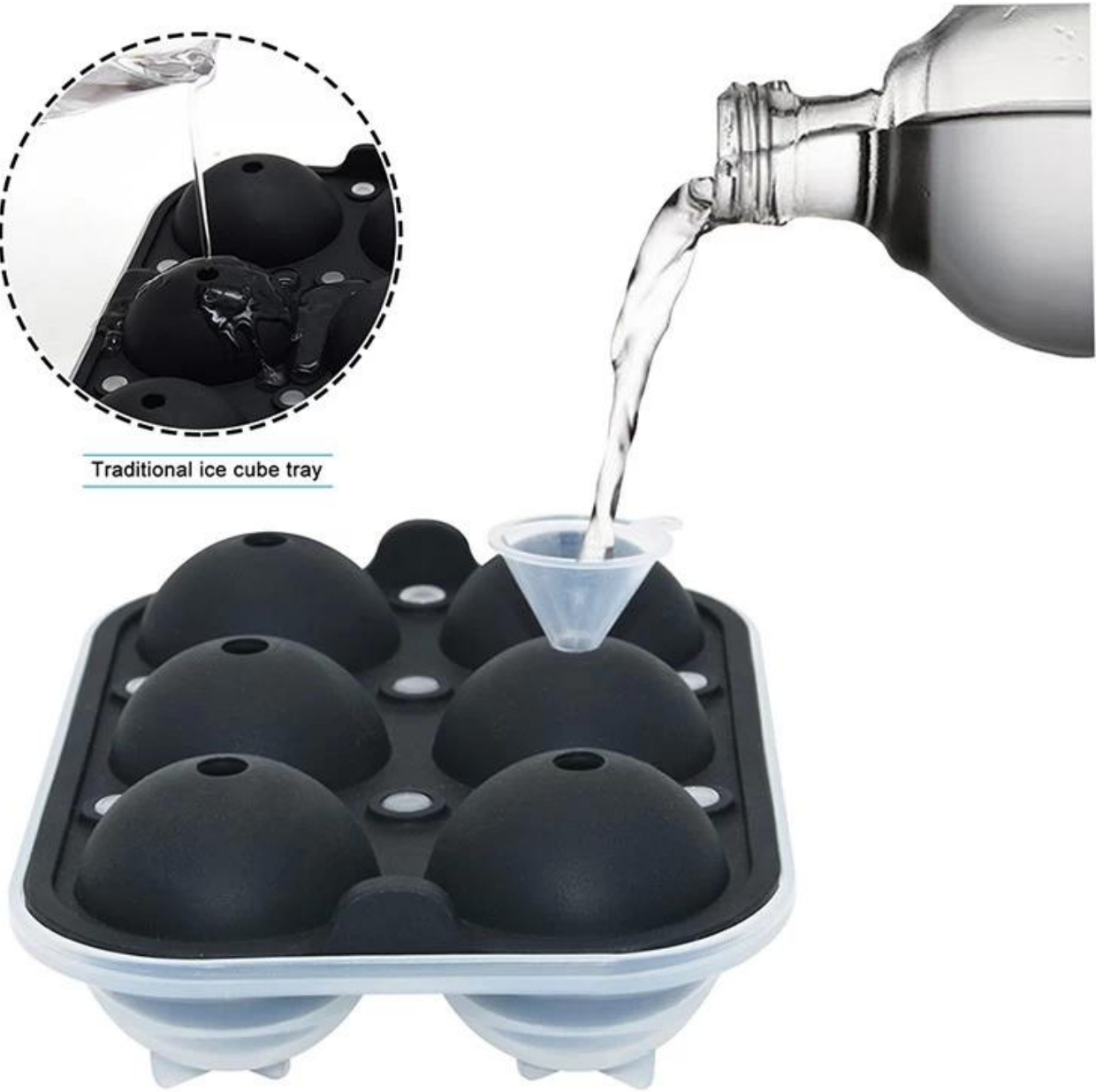
Ice cube tray with plastic Filling Funnel