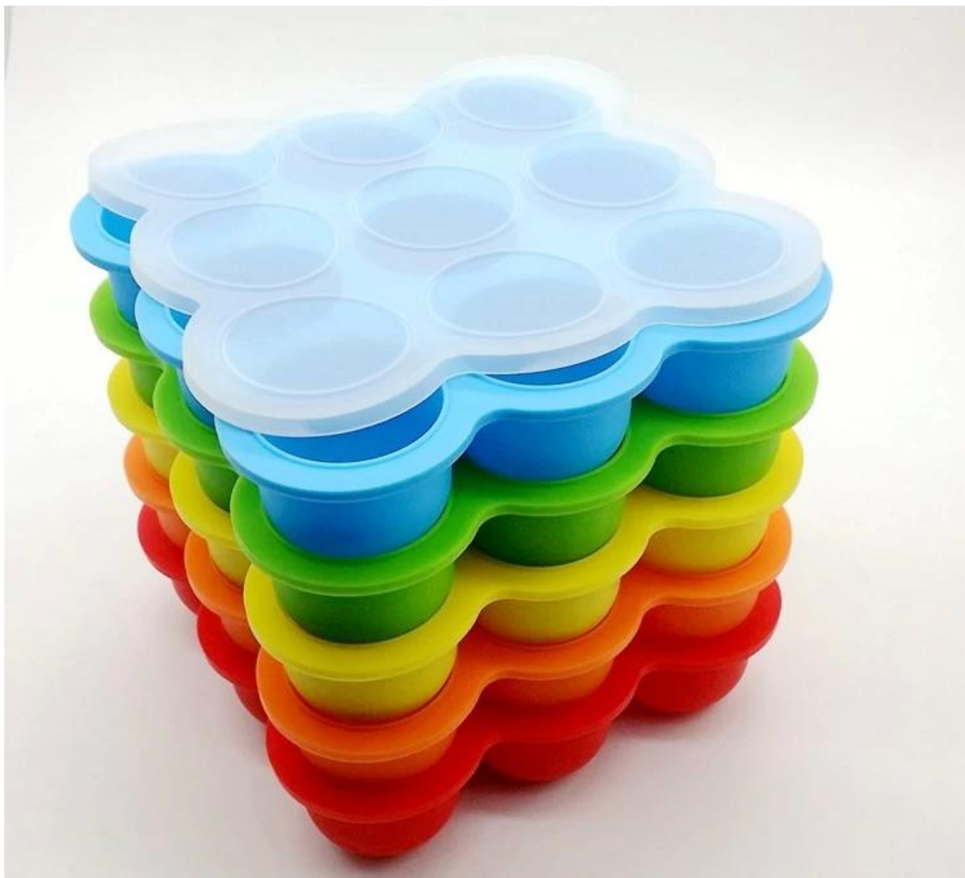
Outros itens da série do bebê