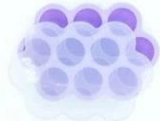
10 cup baby food storage container