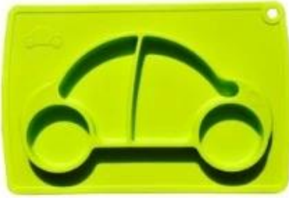
car silicone placemat