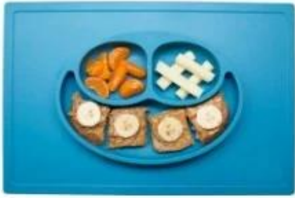
square smily silicone placemat