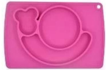
snail silicone placemat