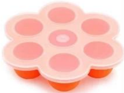
7 cup baby food storage container