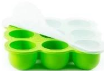
9 cup baby food storage container