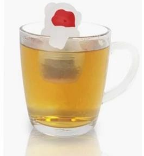
Dinosaur tea infuser