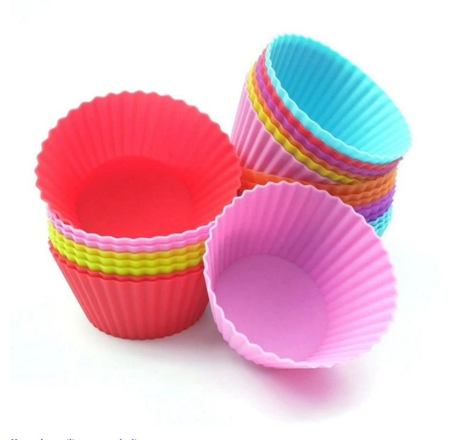
Heart shape silicone cupcake liners