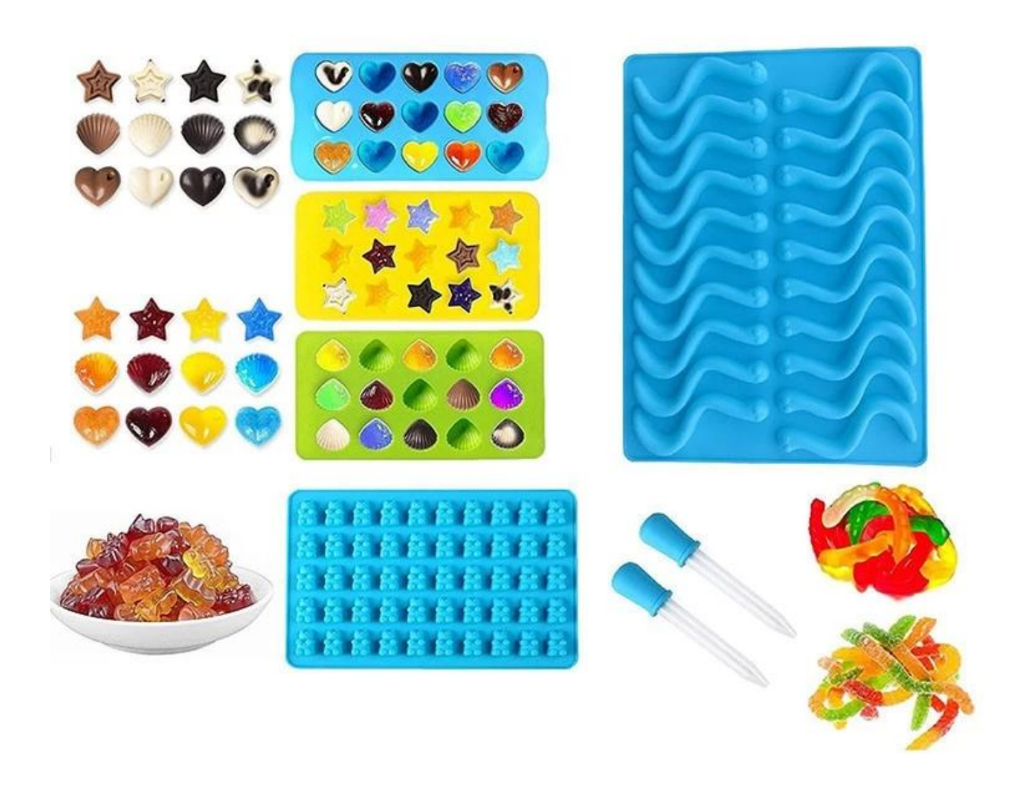
30 cavity chocolate mold