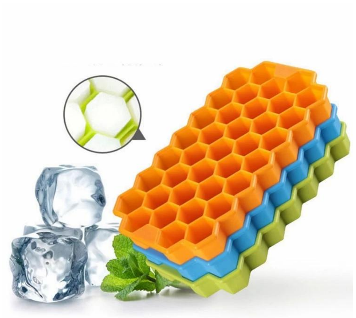
Ice cube tray& ice ball set