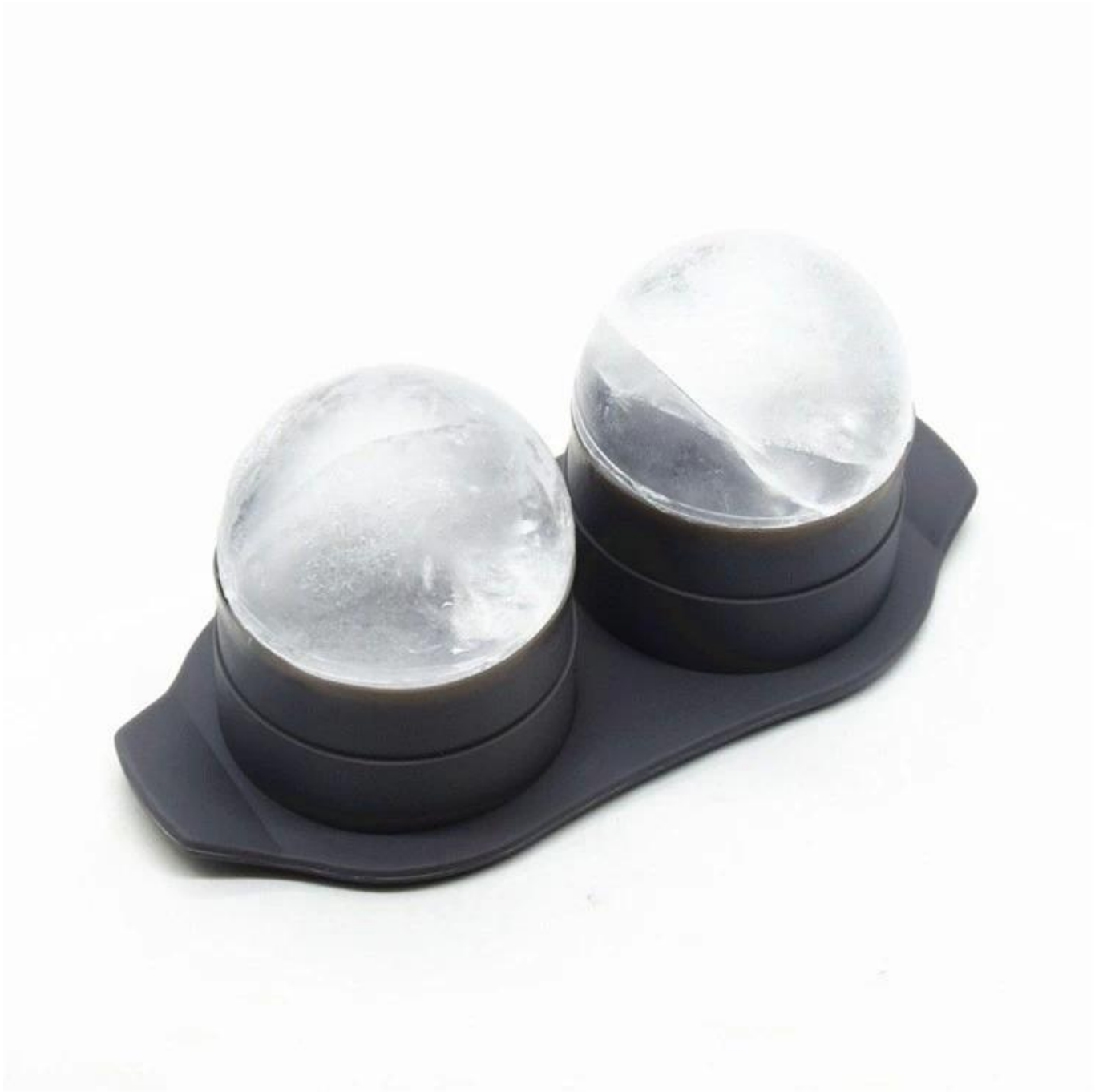
Similar to ice hockey mold