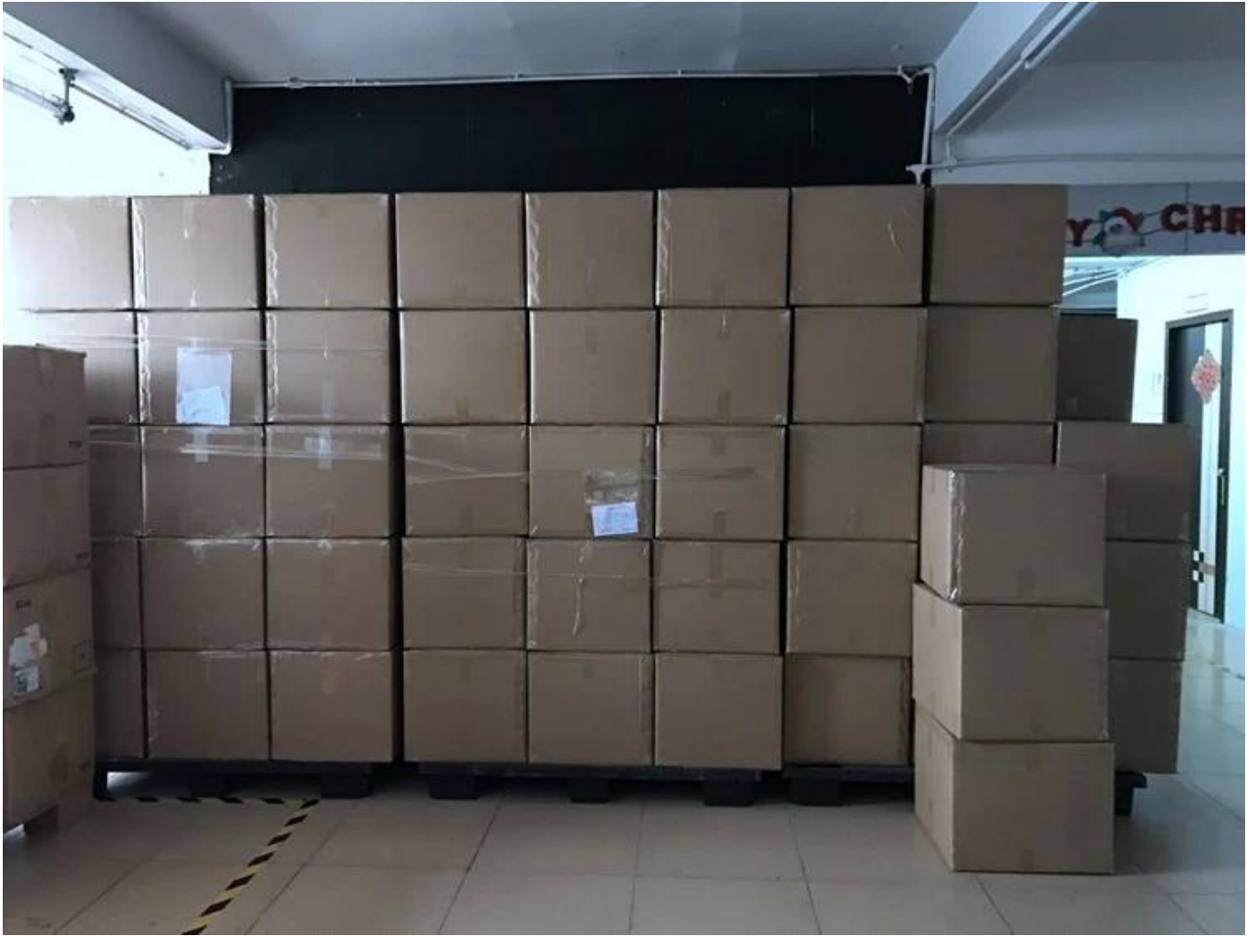
Pallet with plastic wrap