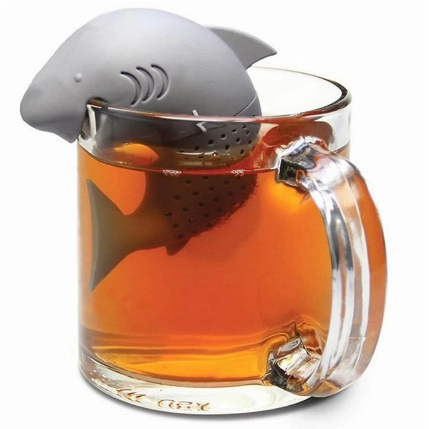
Temperature Sensitive Teamong Tea Infuser