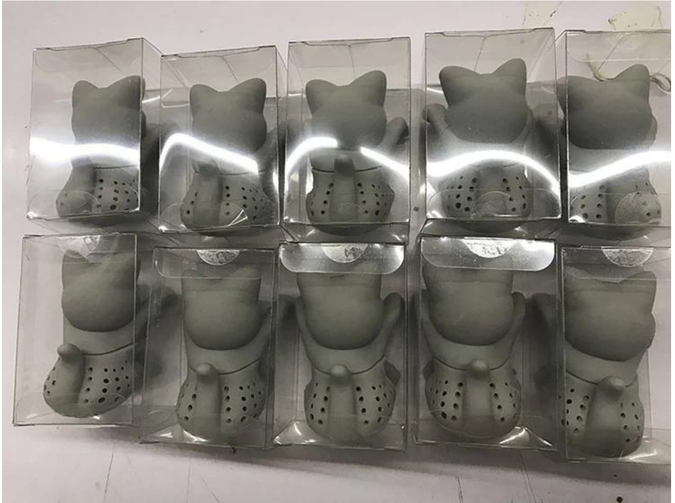
Paper gift box package