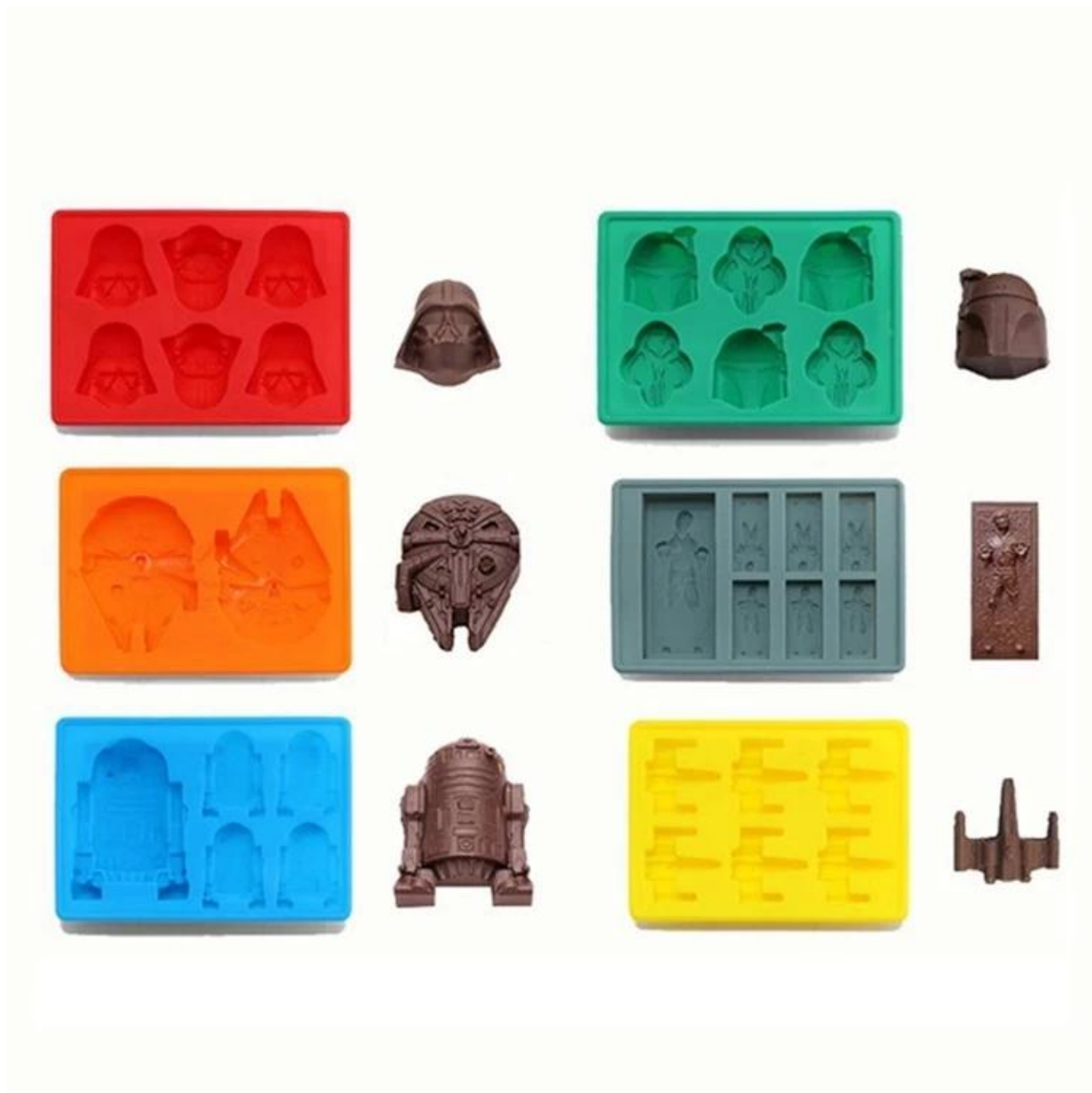
30 cavity chocolate mold