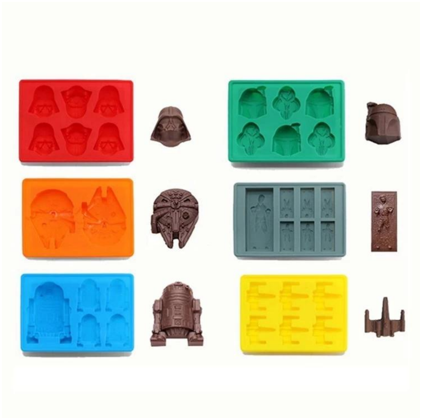
30 cavity chocolate mold