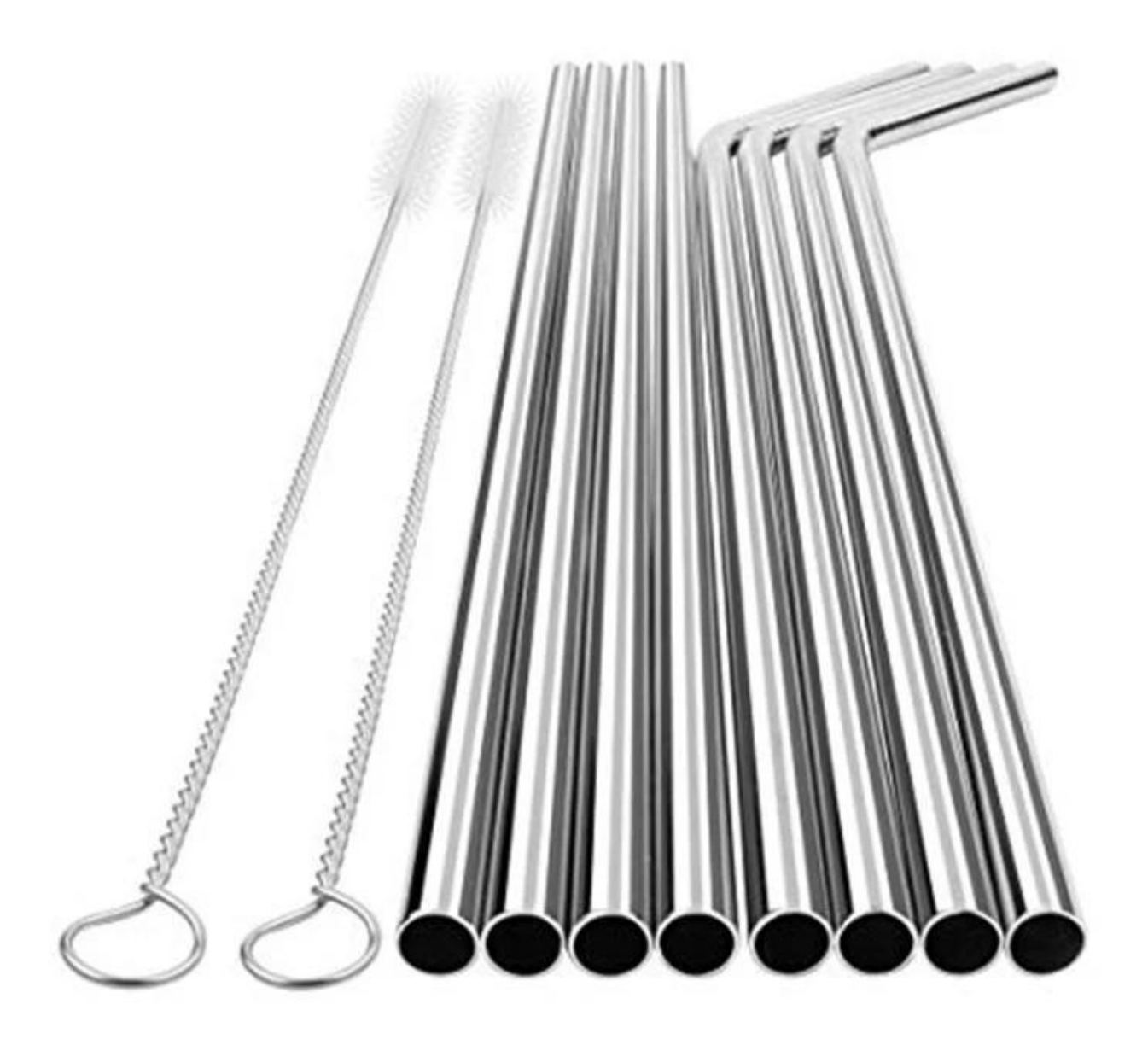
Other Straws for silicone