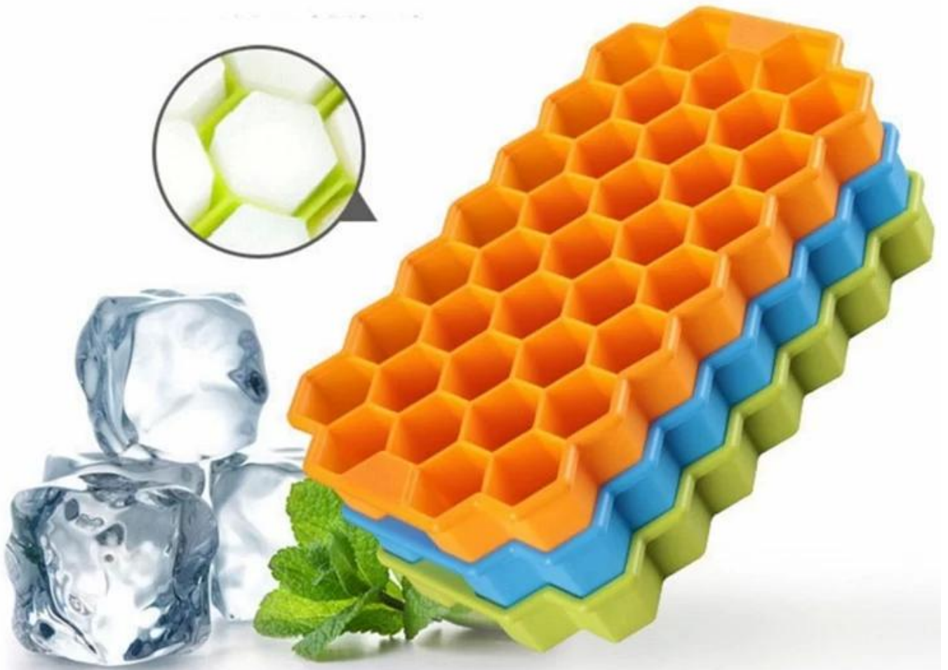
Ice cube tray& ice ball set