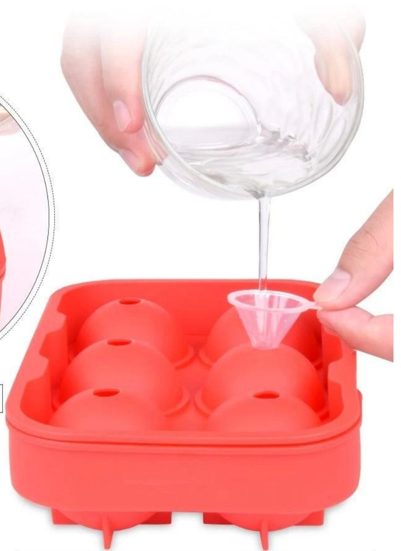
Ice Cube Tray with Plastic Filling Funnel