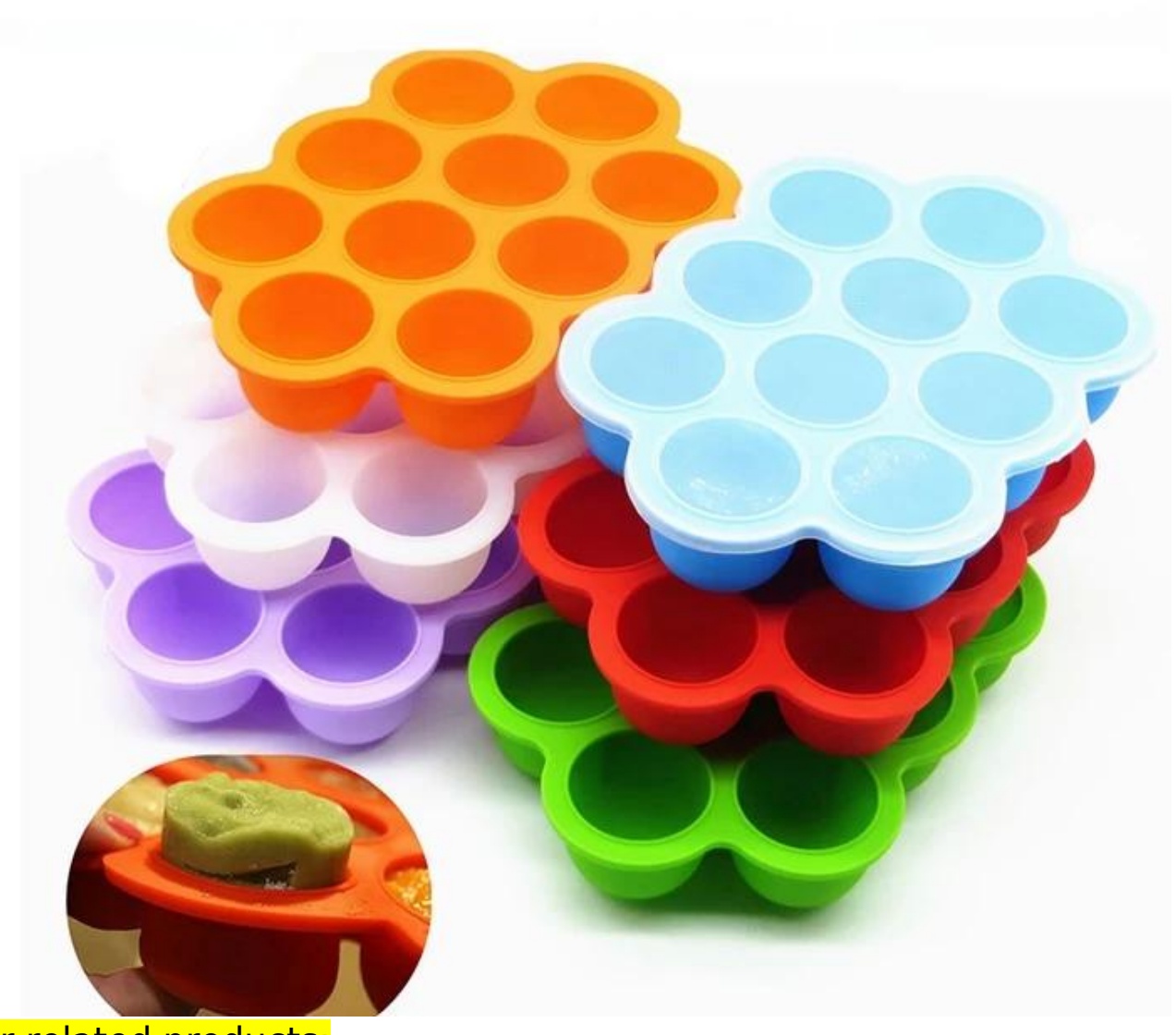
Other related products: