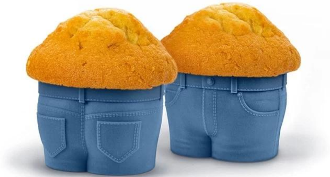
Round shape silicone cupcake liners