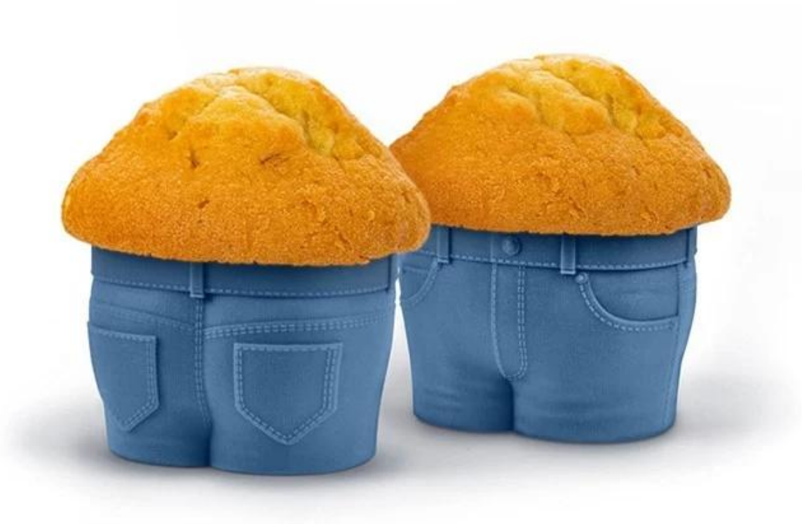
Round shape silicone cupcake liners