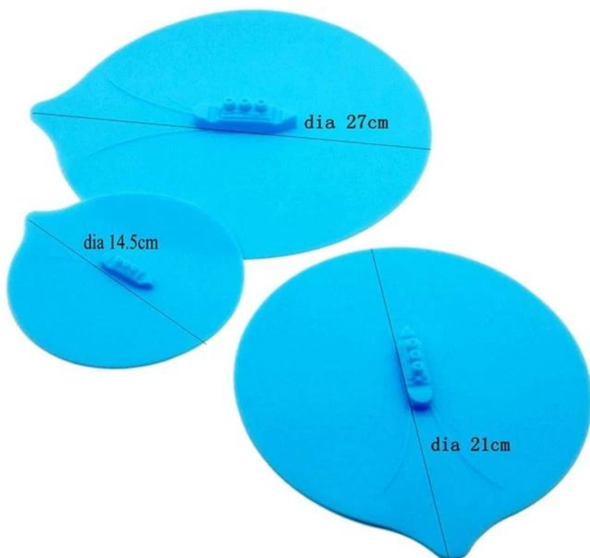
Silicone pot lid