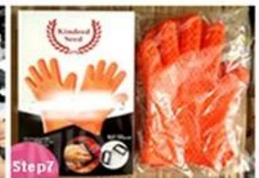
Step7 QC and Packing