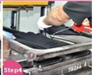
Step4 Vulcanizing and Shaping