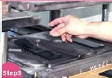
Step3 Material placing