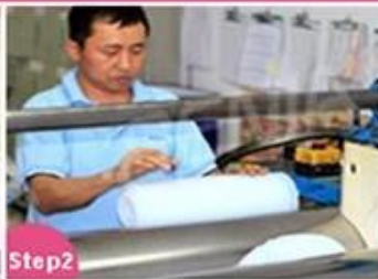
Step2 Material mixing and cutting