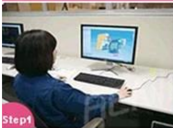
Step1 3D drawing