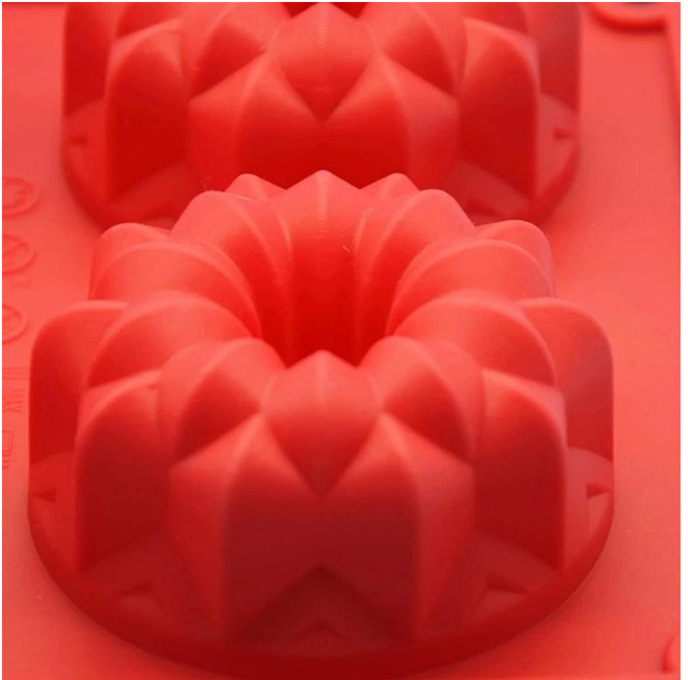
Heart Shape silicone cupcake liners