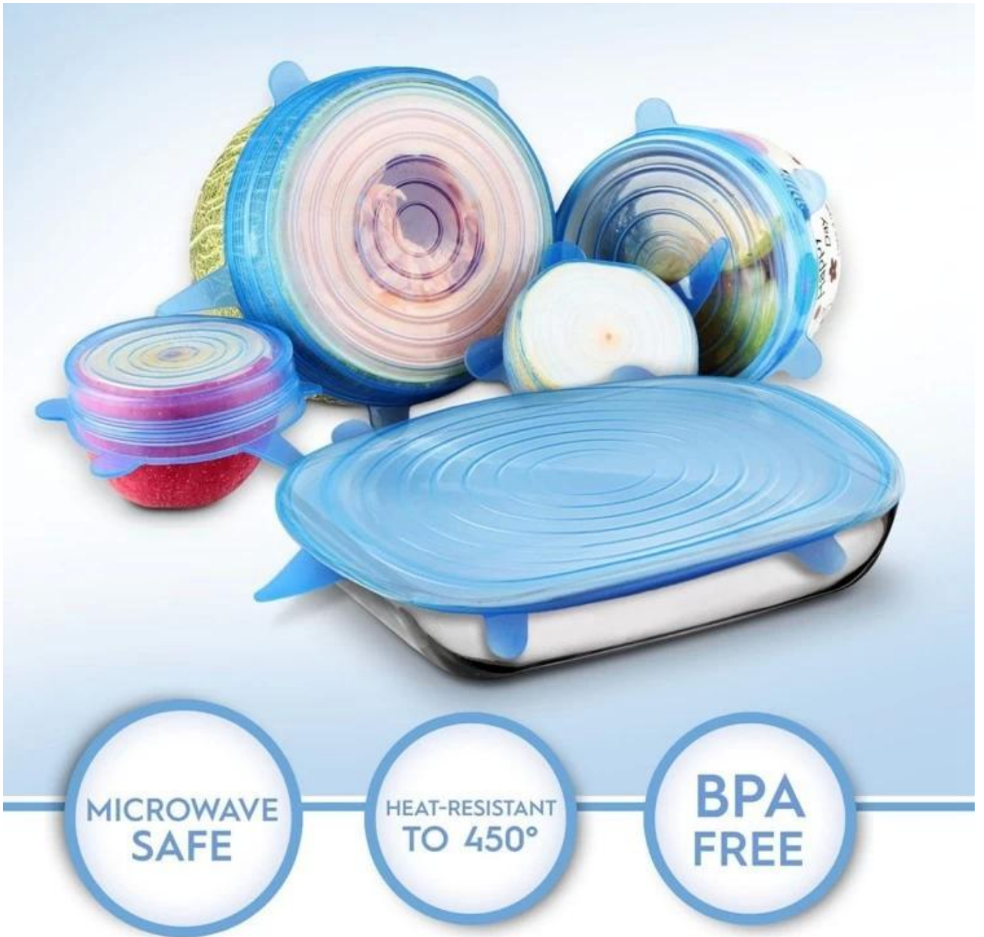
Steamship silicone pot lid