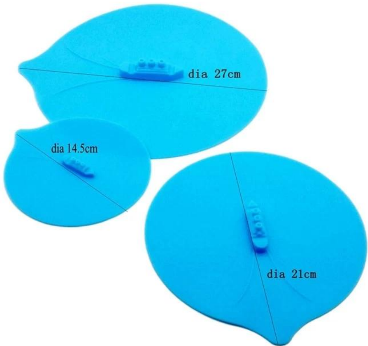
Silicone pot lid