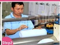
Step2 Material mixing and cutting