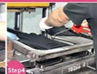
Step4 Vulcanizing and Shaping