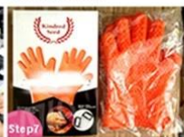
Step7 QC and Packing