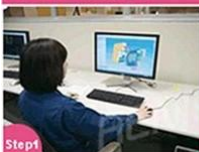
Step1 3D drawing