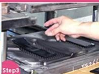
Step3 Material placing