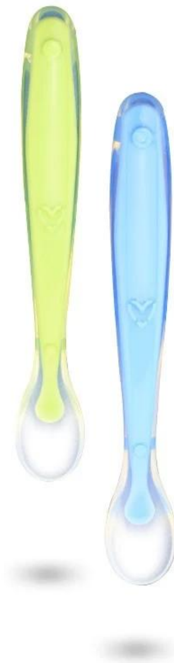
COLORFUL SILICONE SPOON SET