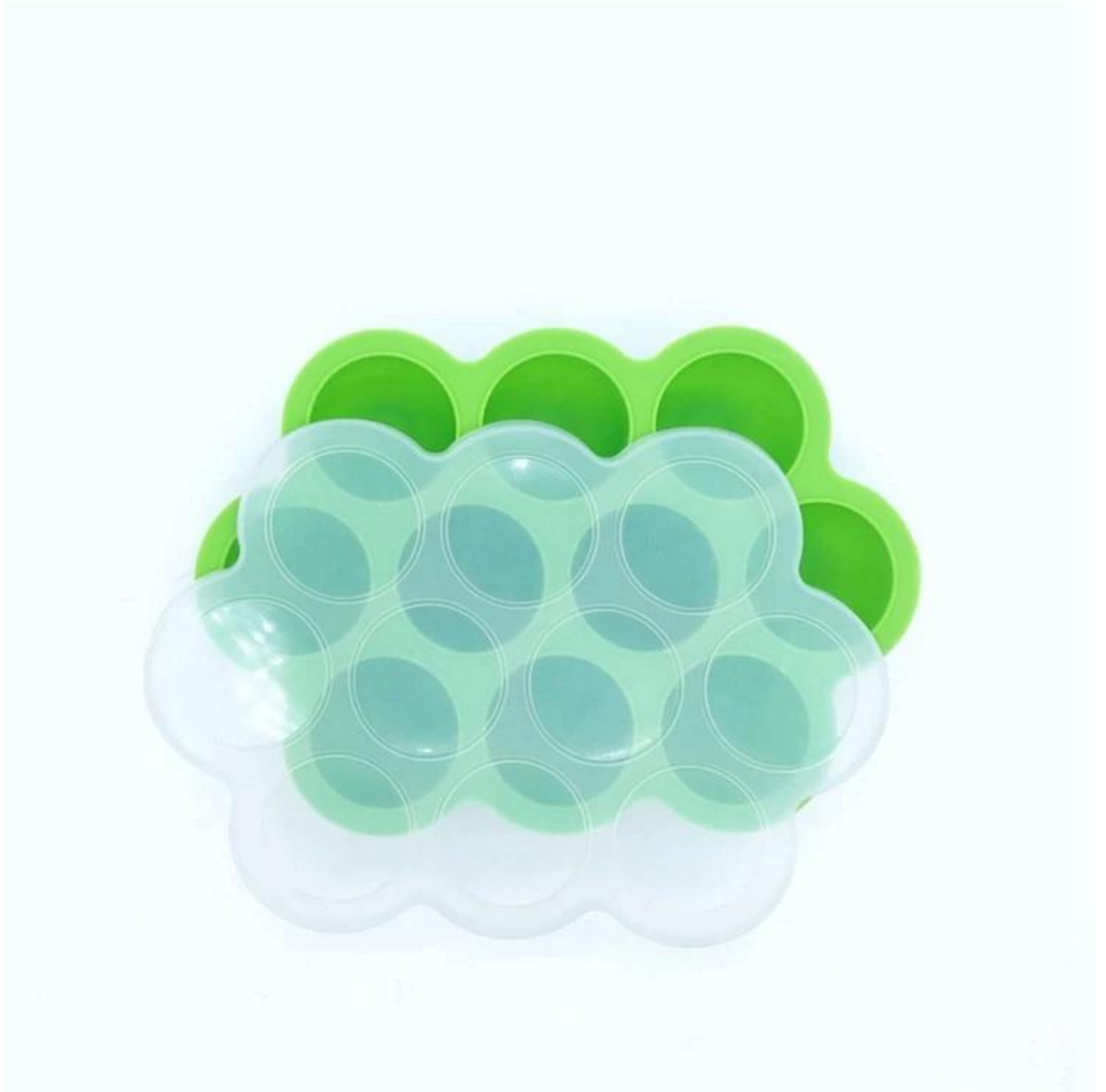
Other baby series items