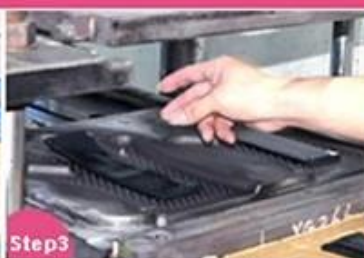
Step3 Material placing