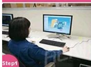
Step1 3D drawing