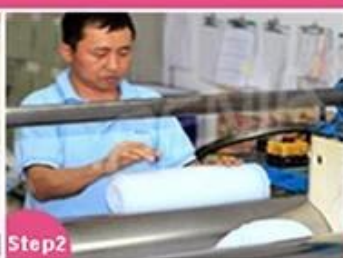
Step2 Material mixing and cutting