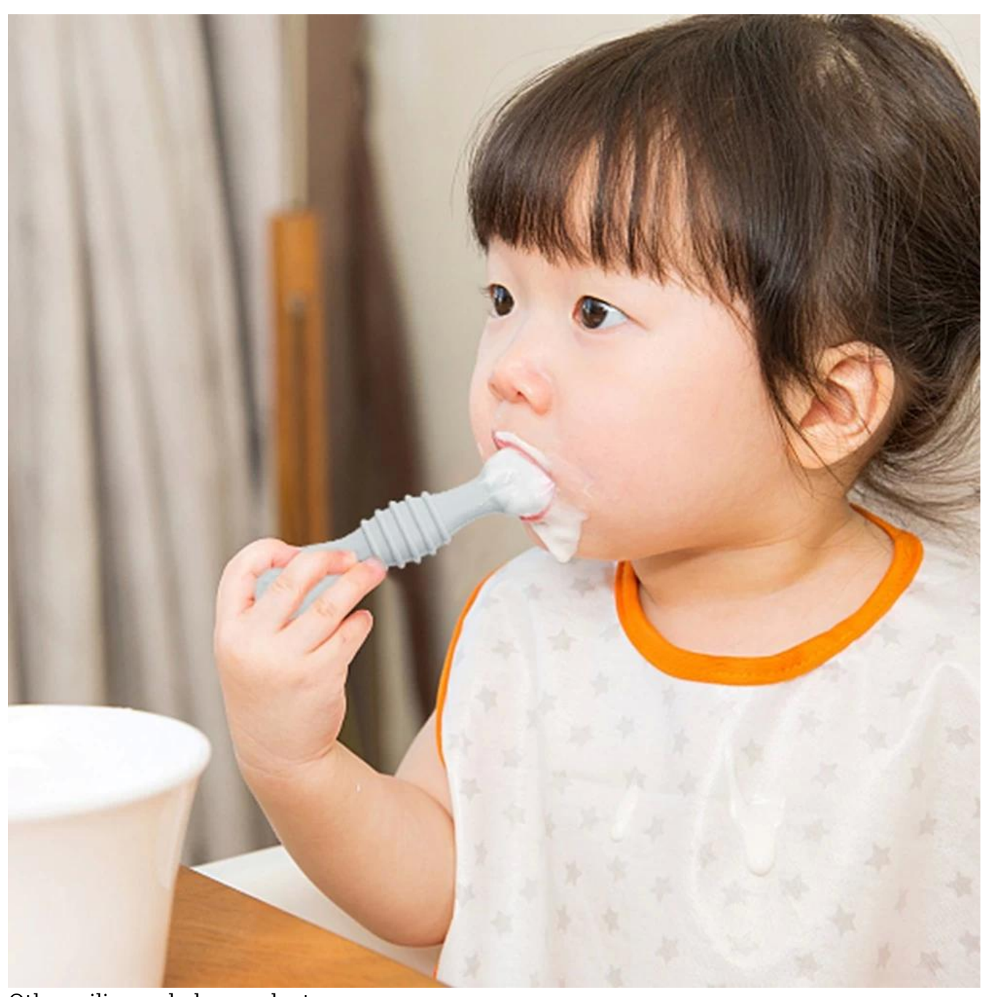
Other silicone baby products: