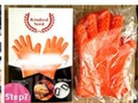
Step7 QC and Packing