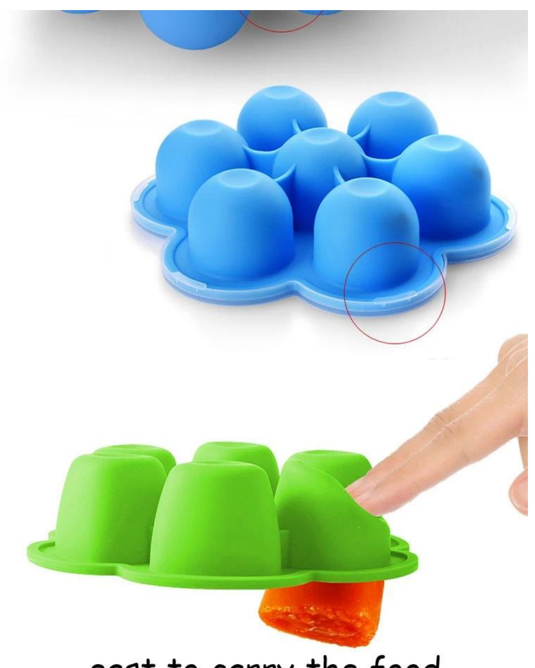
east to carry the food