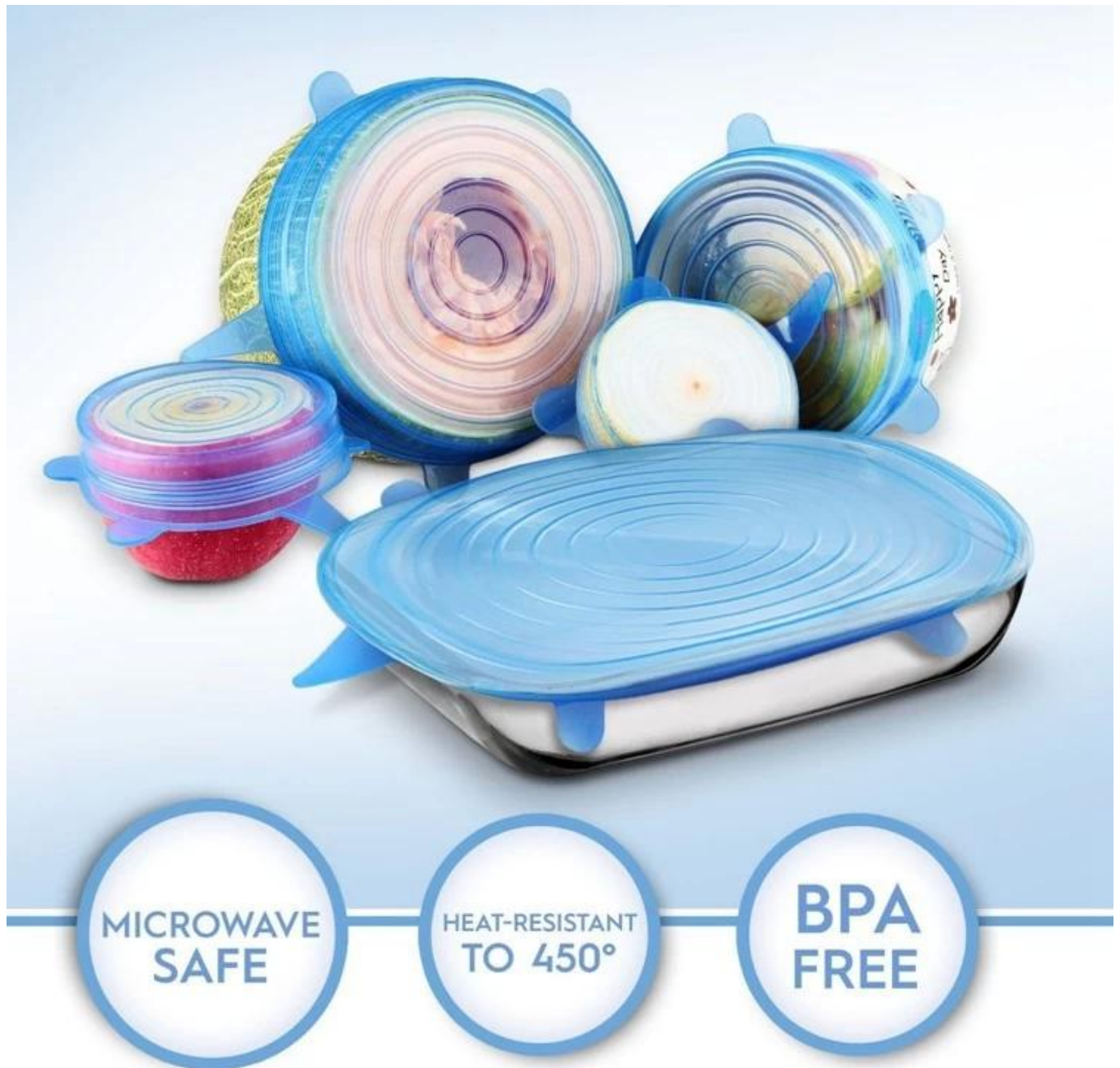
Steamship silicone pot lid