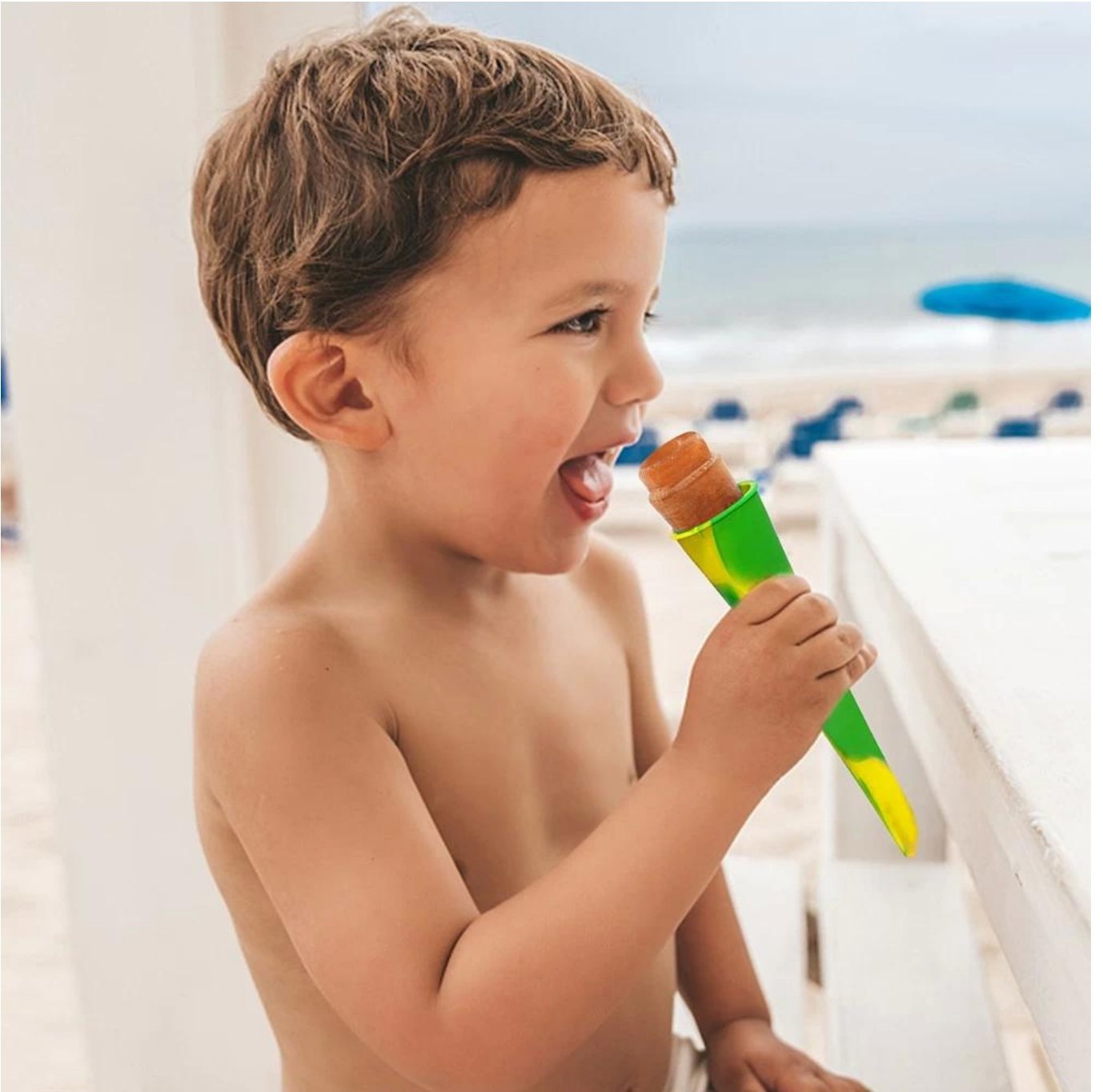
Other hot selling ice mold