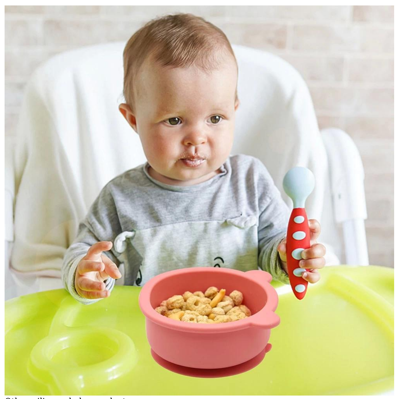
Other silicone baby products: