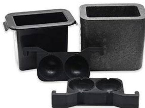
2Cavity 7.5cm Sphere