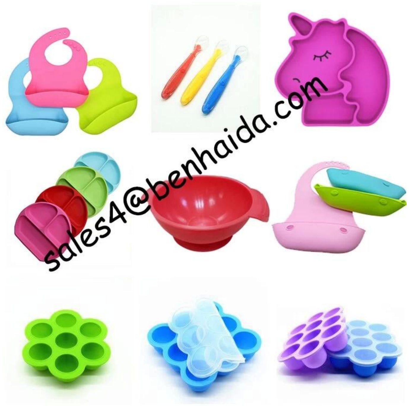
Other silicone baby products: