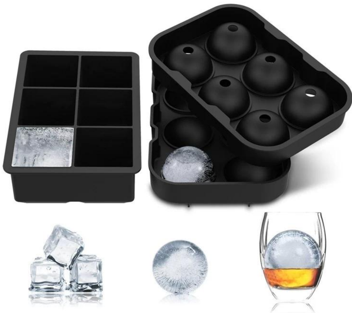
Silicone Ice Cube Similar Tray / Ice Ball Mold