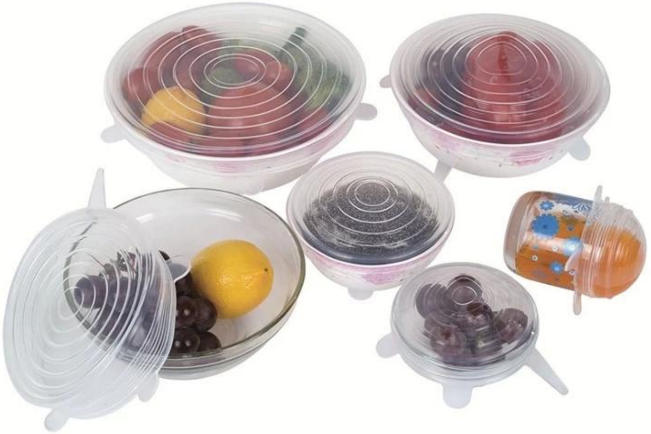
Similar Silicone pot lid/silicone suction lid