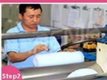
Step2 Material mixing and cutting