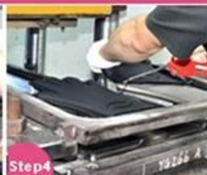
Step4 Vulcanizing and Shaping