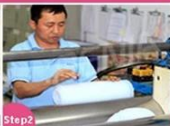
Step2 Material mixing and cutting