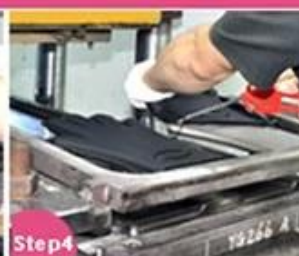
Step4 Vulcanizing and Shaping