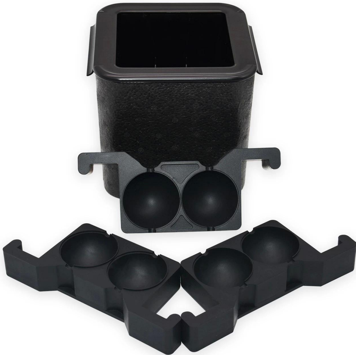
Ice tray & ice hockey set