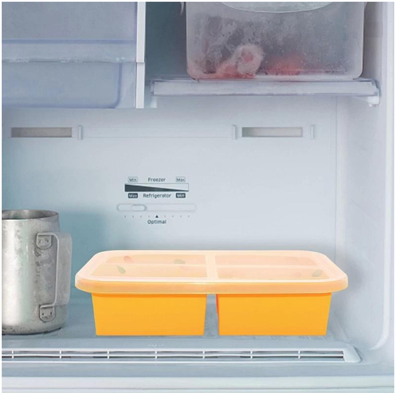
Similar soup tray