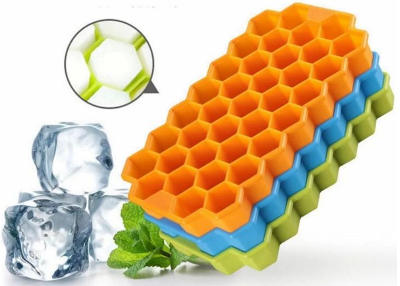
Ice cube tray& ice ball set