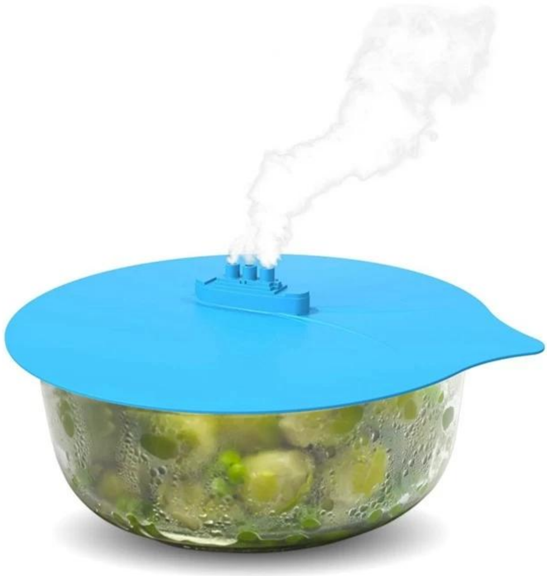
Similar Silicone pot lid/silicone suction lid