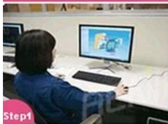
Step1 3D drawing