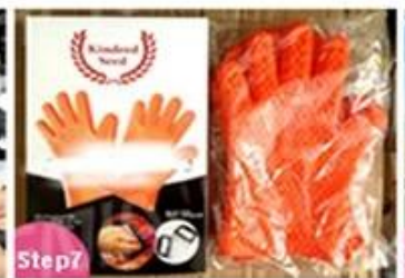
Step7 QC and Packing