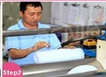
Step2 Material mixing and cutting