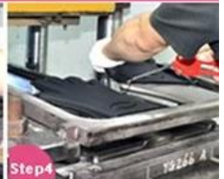
Step4 Vulcanizing and Shaping