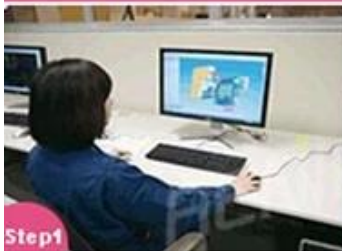
Step1 3D drawing