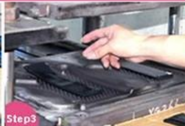
Step3 Material placing