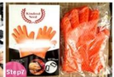
Step7 QC and Packing