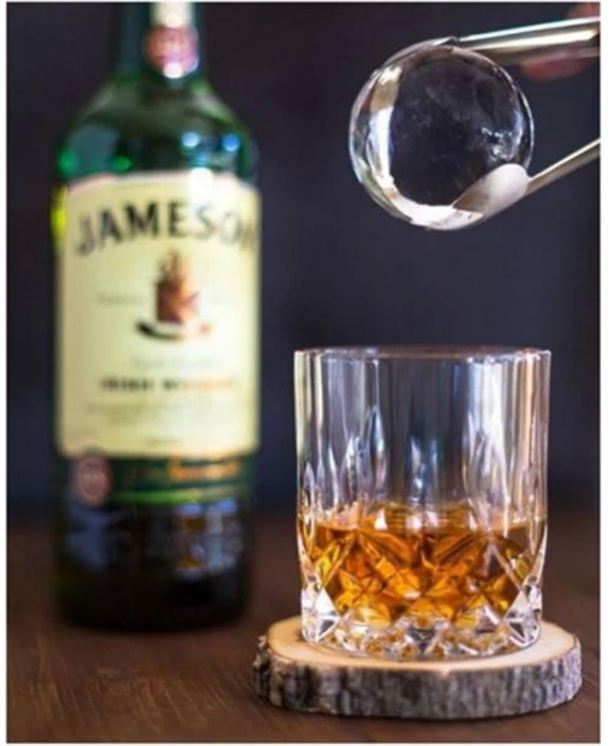
Standard Ice Ball Molds