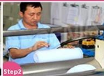
Step2 Material mixing and cutting