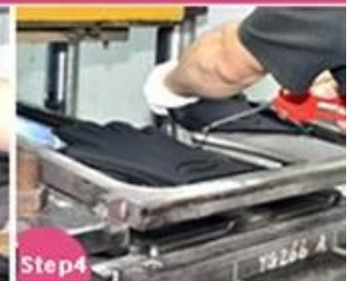
Step4 Vulcanizing and Shaping