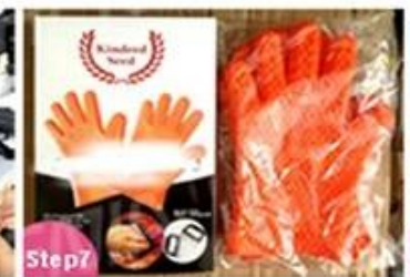
Step7 QC and Packing