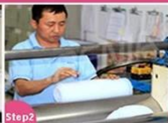
Step2 Material mixing and cutting