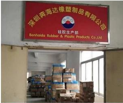
1. BHD Factory