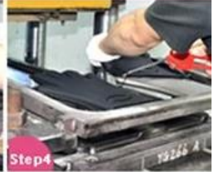
Step4 Vulcanizing and Shaping