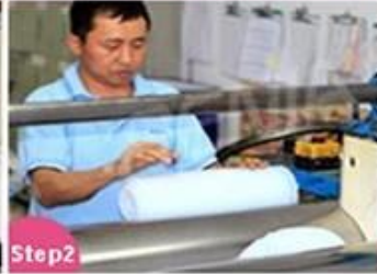
Step2 Material mixing and cutting