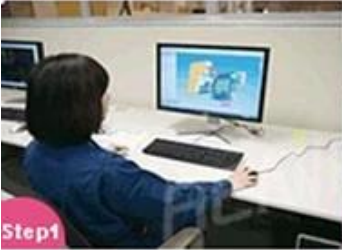
Step1 3D drawing