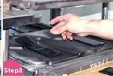
Step3 Material placing