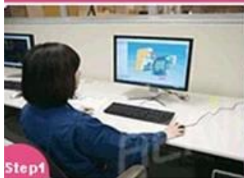
Step1 3D drawing