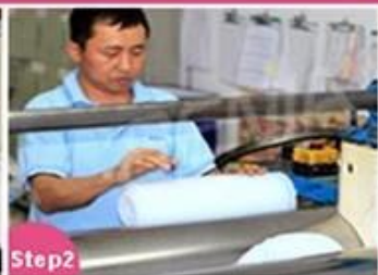
Step2 Material mixing and cutting