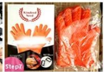
Step7 QC and Packing