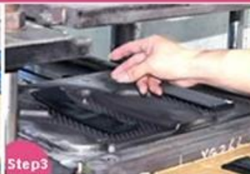
Step3 Material placing