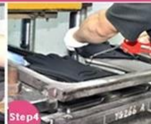
Step4 Vulcanizing and Shaping