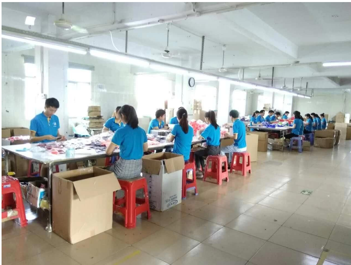
La nostra squadra