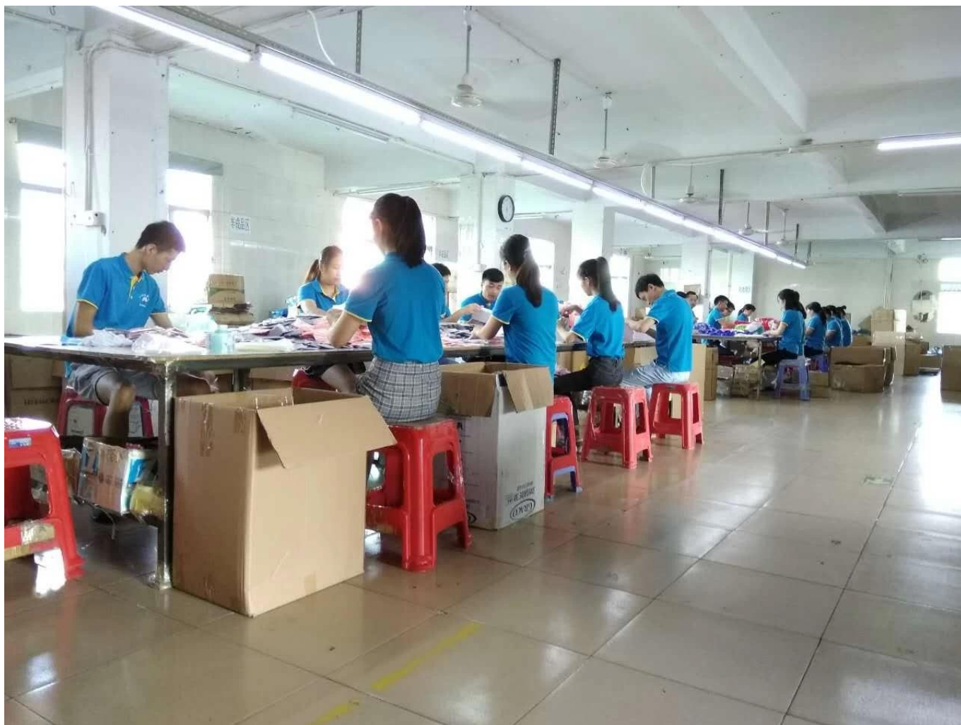
La nostra squadra